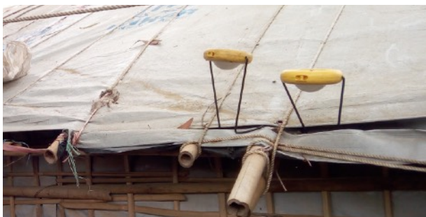
Lamps can be carried around or fixed to rooftops to provide light at night and charge during the day

Initial feedback was very positive, and recently we have been able to interview some of the families using the lights.