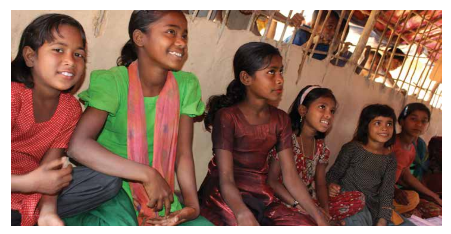
Photo: Refugee children enjoying their class.