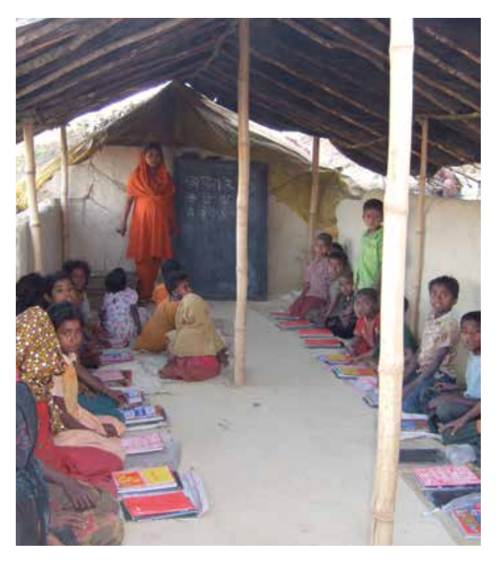
Photo: Low-profile classrooms are made of mud and sticks, woven into the structure of the make-shift camp.

After the expansion to 2,700 children, a 2015 review examined whether components were consistent with objectives, determined factors that enabled or created constraints; and highlighted areas requiring attention. An external final evaluation was conducted by an education specialist to assess impact and inform future learning.